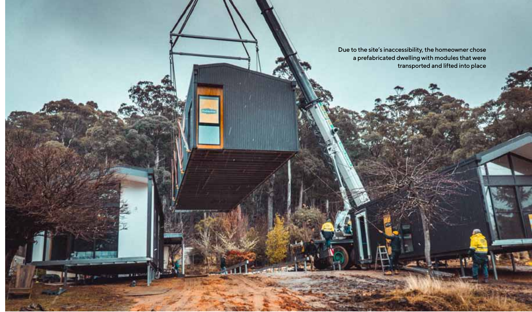
Due to the site's inaccessibility, the homeowner chose a prefabricated dwelling with modules that were transported and lifted into place

underground wine cellar and whisky tasting room. With 360-degree views of the surrounding alpine environment, the most important element of this home was a fluid connection between indoor and outdoor spaces. In every room one can enjoy the view, whether it's looking at the snow-covered mountain ranges through the glass gable or the national park through the home's glass linkways.